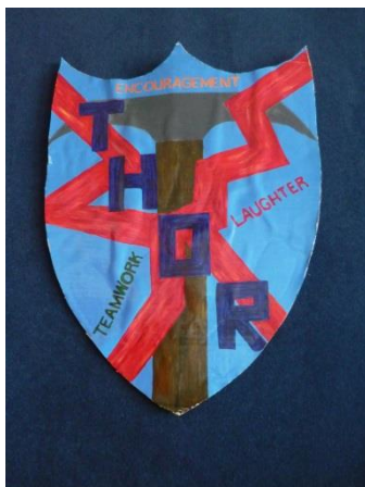
THOR - blue