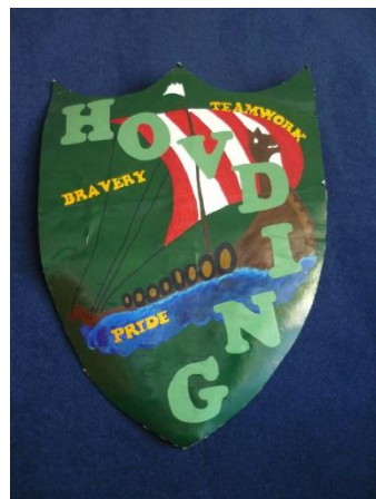
HOVDING - green