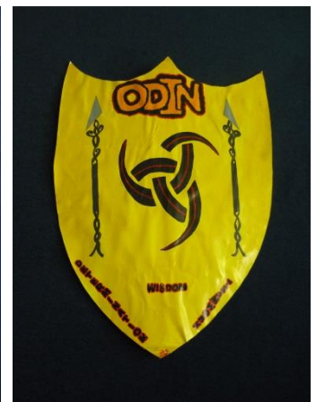
ODIN - yellow