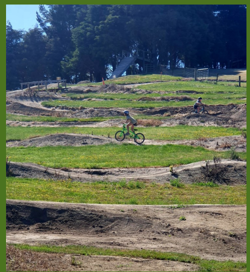
Some early photos sent in today of the senior leadership camp at Ranui Farm