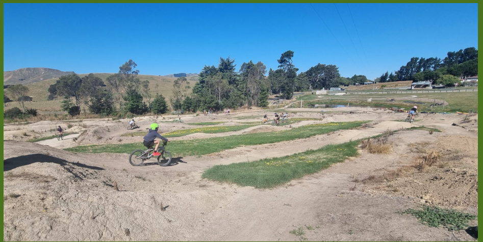
More shots from our senior leadership camp last week