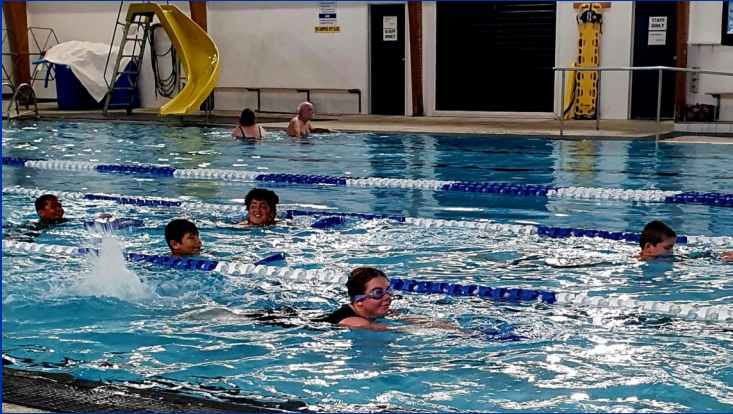
Photos from Monday's swimming lessons at Wai Splash for Rata and Kahikatea.