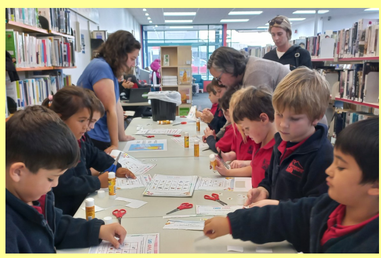
Bushy Park Whanganui