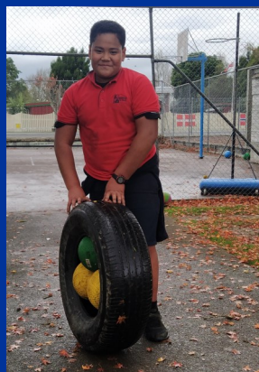
Photos from our Cyclone Relief Day held in Norsewood last Friday